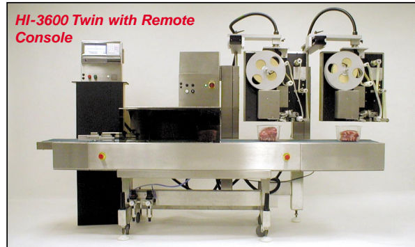
HI-3600 Twin with Remote Console

WHEN THE CONSOLE that is normally mounted on the HI, HC, WI, MI or LI-3600 is inconvenient, it is possible to re-position it at a more convenient location using the 'remote console kit'.